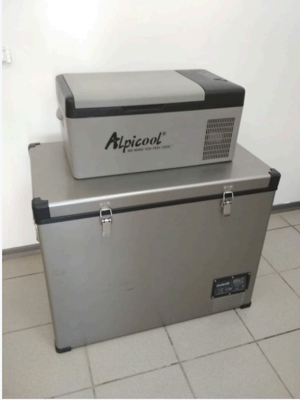
Refrigerators for transporting the entomophaga eggs and nymphs