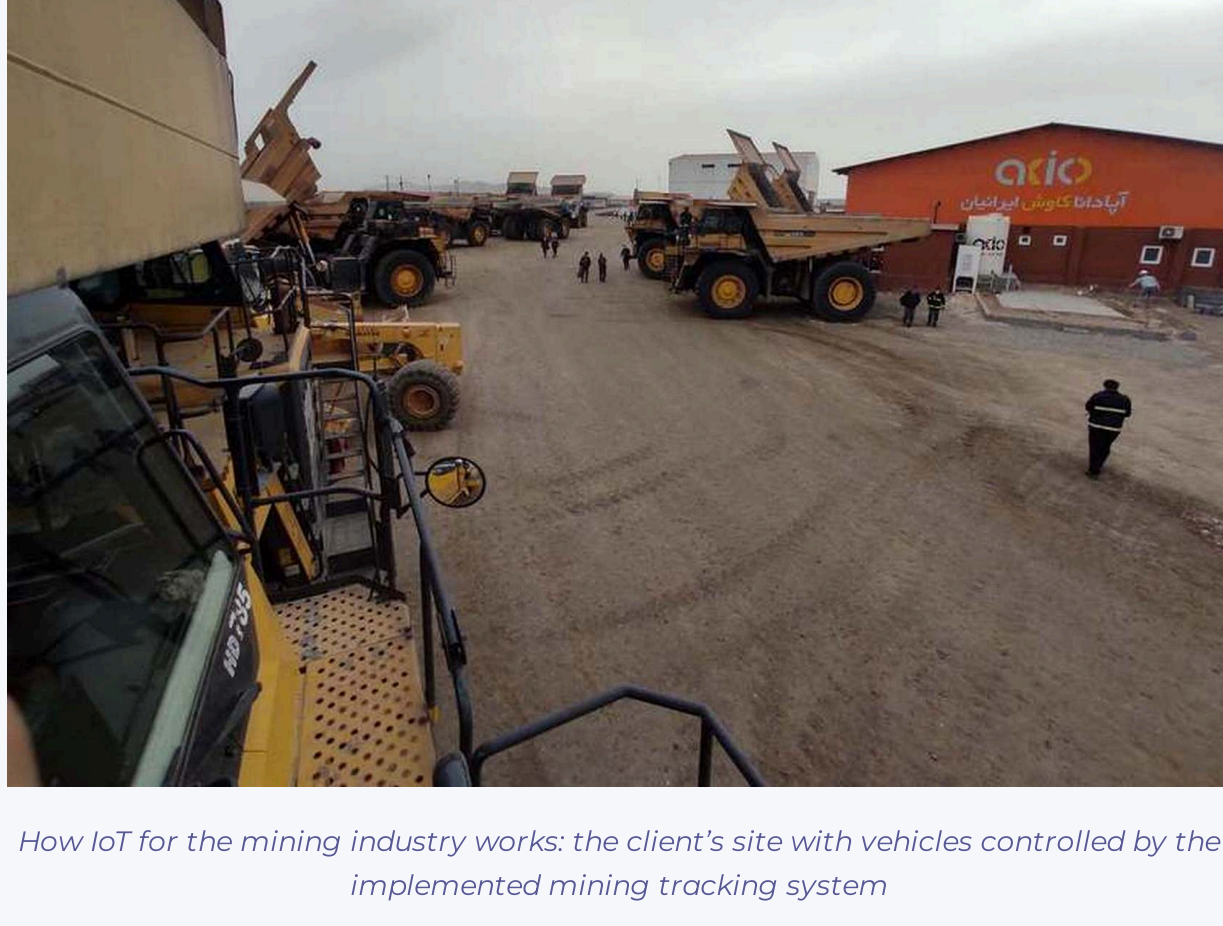
How IoT for the mining industry works: the client's site with vehicles controlled by the implemented mining tracking system

Integration of these system components was offered for deeper automation of mining operations: for example, maintenance and warehouse modules are integrated with each other as maintenance activities utilize spare parts and materials stored in warehouses.